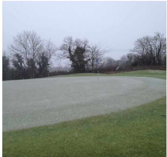
The 4 th white (I mean green!) on Thursday the 29 th .