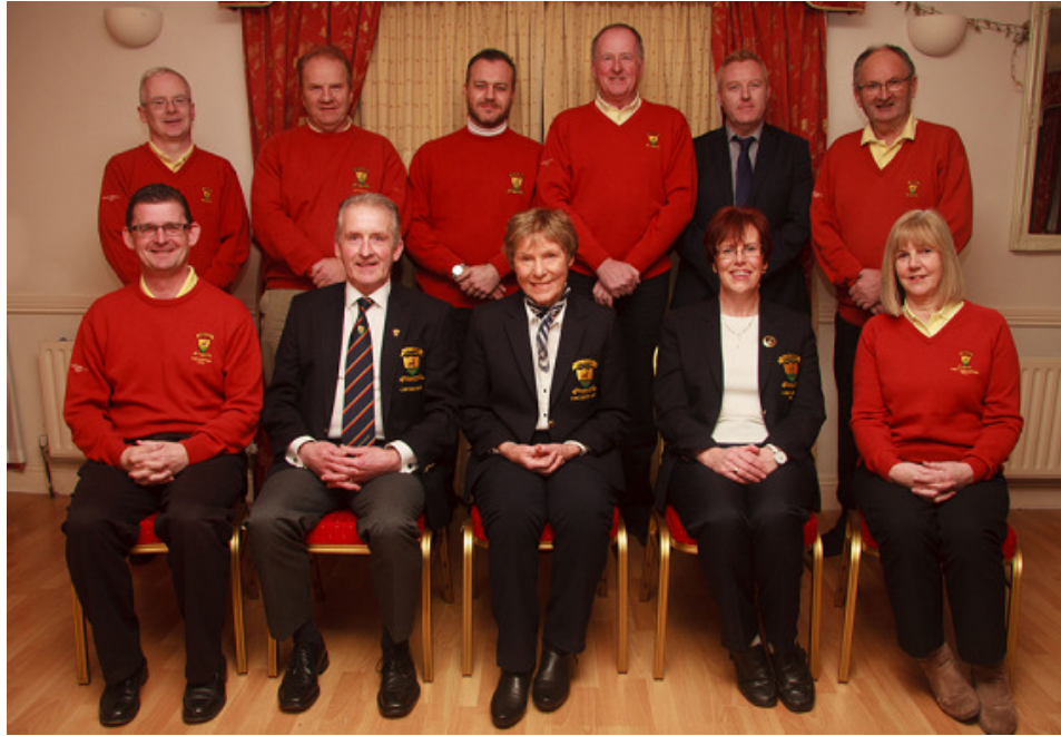
The Committee Of Management

The following photo had not been taken in time for the last Newsletter which is the current Committee Of Management: